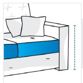
4. Front Height: Front height of the Sofa incluing Arm Rest(From ground to seat if no arm)

We encourage you to upload the image of the article you need the cover for - this helps our team ensure covers are designed keeping your requirements in mind.